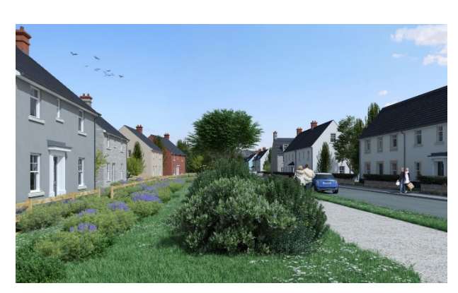
Artist's impression of new development at Crick Road, Portskewett

MCC has agreed in principle to establish a Development Company, part of the remit of which would be to disrupt the housing market and build homes, including discounted market rent.