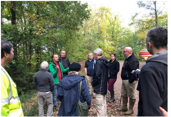
Site visit to look at potential Natural Flood Management pilot

Other work has included invasive weed mapping and control and piloting some Natural Flood Risk