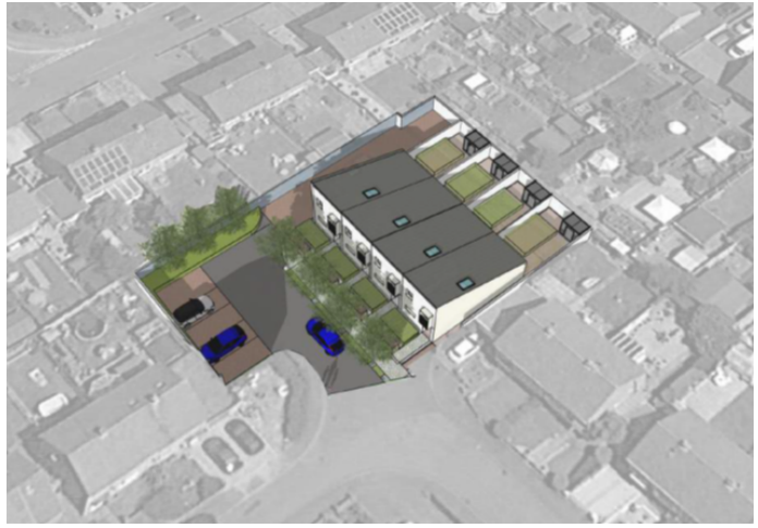
Design of new homes as part of the Welsh Government's Innovative Housing Fund

Monmouthshire Housing Association, working in partnership with the Welsh School of Architecture and MCC, has delivered its first tranche of homes funded by the Welsh Government's Innovative Housing Fund (sites in Caldicot and Abergavenny).