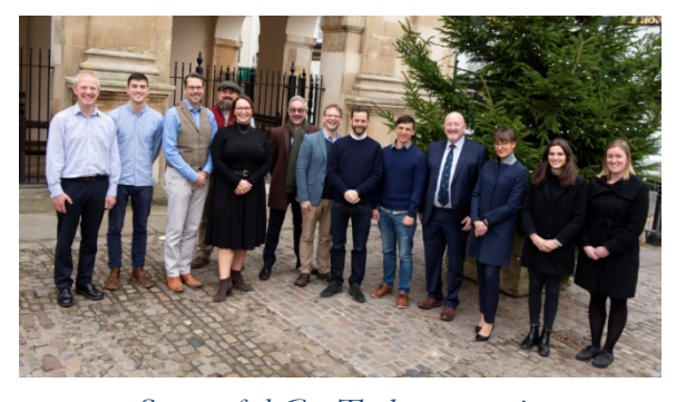
Successful GovTech companies

A bid was submitted to the Cabinet Office's GovTech Catalyst which was created to incentivise technology companies to develop innovative solutions to public sector problems. This bid was successful and resulted in support from the Government Digital Service and Innovate UK as well as funding of up to £1.25 million for firms to encourage them to involve communities in identifying and piloting solutions to the twin challenges of loneliness and rural transport.