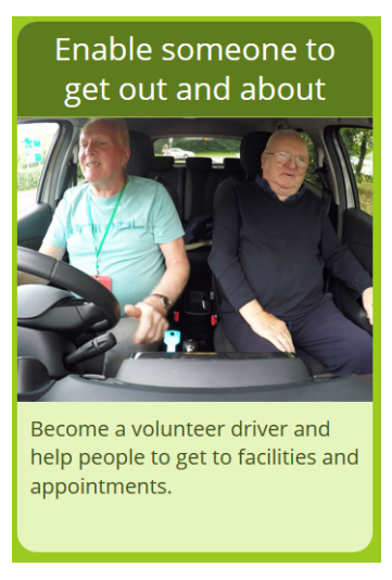
Bridges Centre volunteer driver

The potential exists for Monmouthshire be a place you can live without a car, with a fully integrated and greener, sustainable transport service that maximises the potential of all modes of transport delivering clear and sustainable benefits to economic, social, environmental and cultural wellbeing.